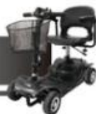
Table 1 SPECIFICATIONS